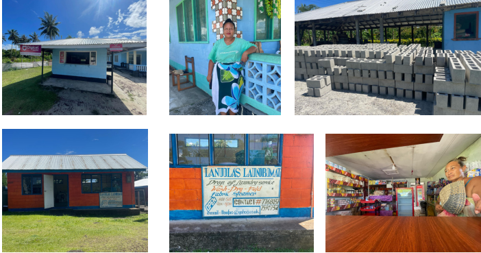
SOME OF THE BLP SMALL GRANT FACILITY BENEFICIARIES IN SAVAI'I.

As part of our ongoing collaboration with Business Link Pacific (BLP) through the Samoa Chamber of Commerce, SBH has been actively supporting local SMEs under the BLP SME grant Initiative. This quarter, our MSME Development Division conducted field visits to the grant beneficiaries allocated to SBH in Savaii. These visits were a crucial step in understanding each business's current operations and needs, and in beginning the development of tailored business plans.